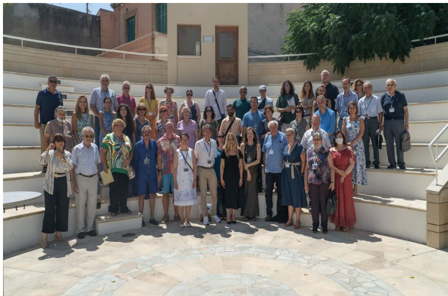
Nicosia, August 27, 2022